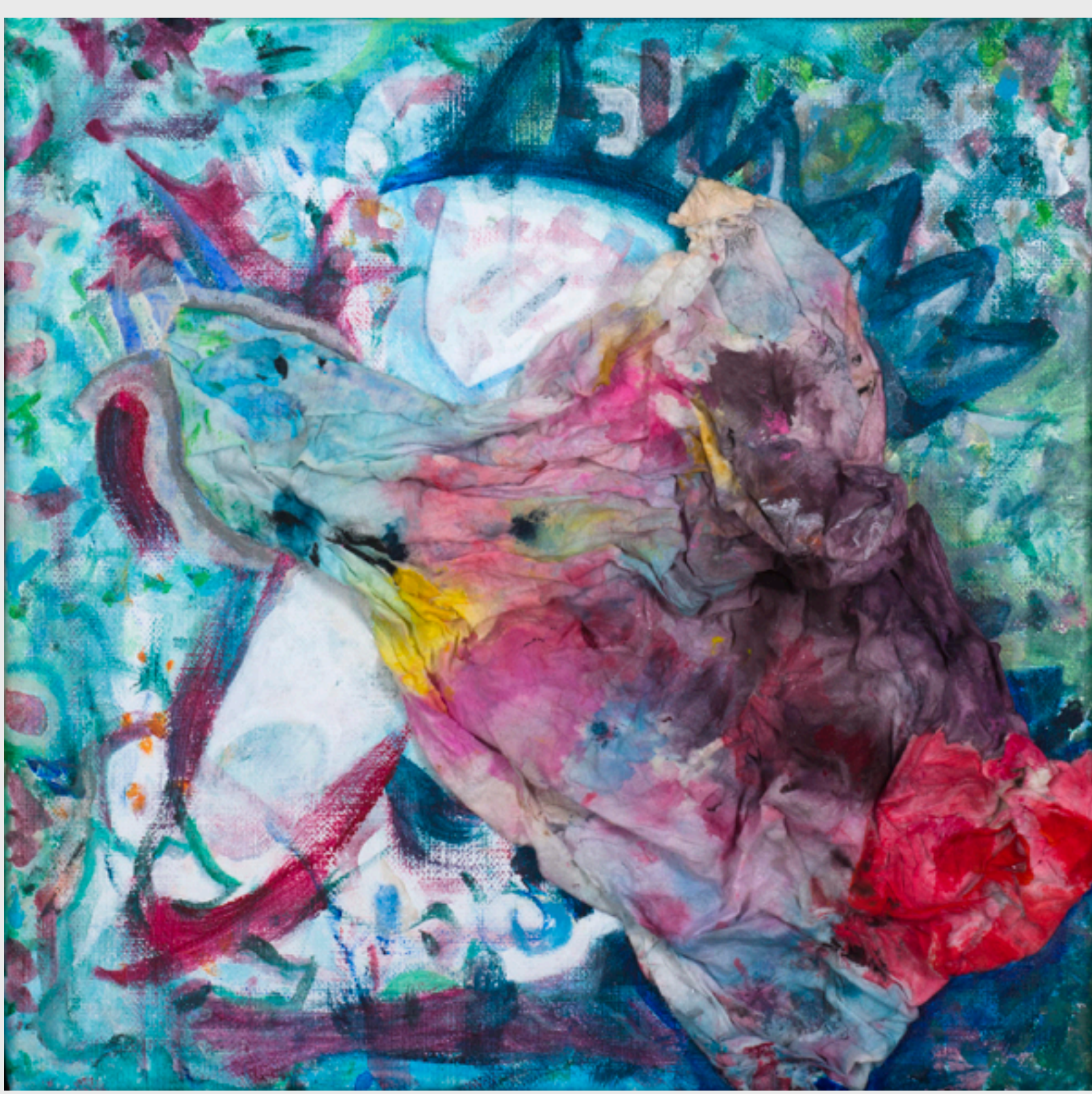
Wrapped 16 by Aderhold

The series "The Motherboard Project" (a sample is attached) deals with the question of how change occurs through interaction. The original painting Motherboard is changed through the other canvases (Takes) that are laid on top of it; at the same time, it shapes the new canvases. The removal of paint produces erasures and new structures, for example. The result is a process of reciprocal formation and change. Traces of paint are left behind on the Takes, and these represent a point of departure for new paintings. The impression is not merely a transferred copy: It is further developed and thus invested with an individuality and identity of its own. What are important to me are spontaneity and the question of how structures form.